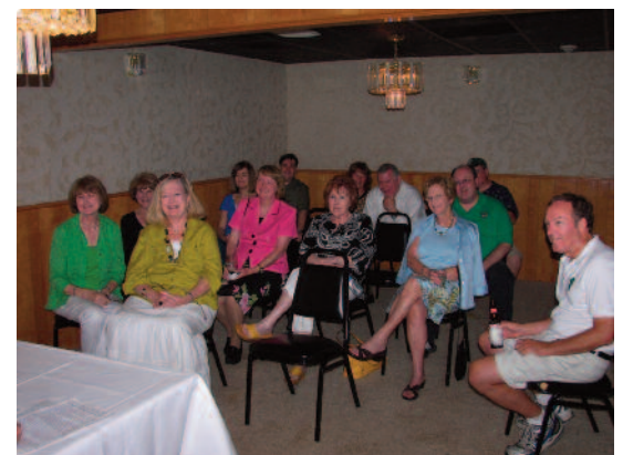
A gathering for the Joyce readings.