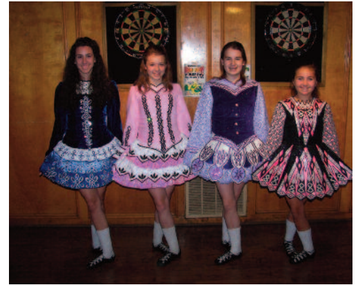
The O'Maoileidigh Dancers.