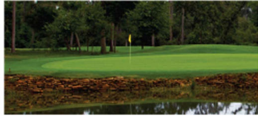
Cypresswood Tradition Course

Eamonn Finnerty 281-435-3432 • efinn@sbcglobal.net